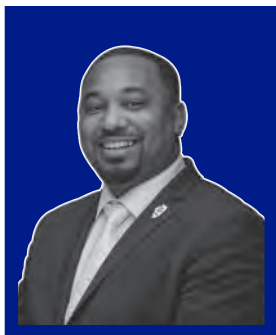
State Senator Willie Preston